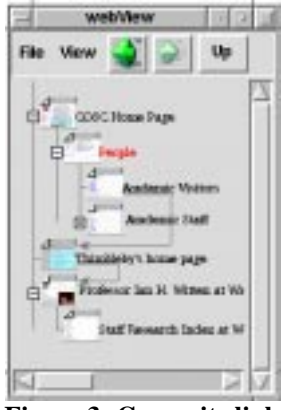
Figure 3: Cross-site link indicators